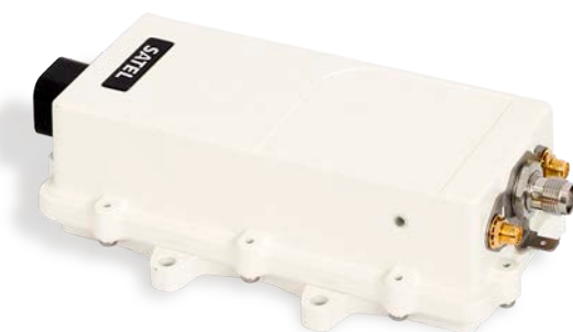
SATEL MCCU-20 LTE / UHF